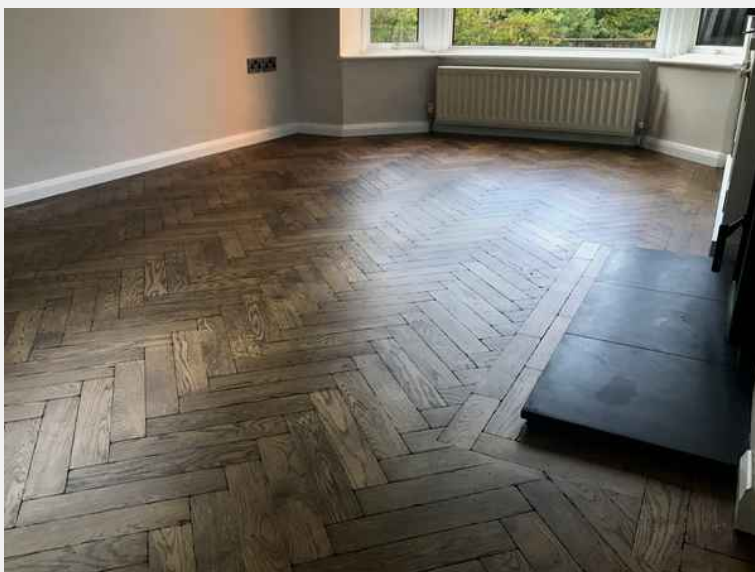
Installed by British Wood Flooring Company

For Homes, Public Houses, Clubs, Schools, New and Period Buildings, Village Halls, Commercial Buildings and Sports Halls.