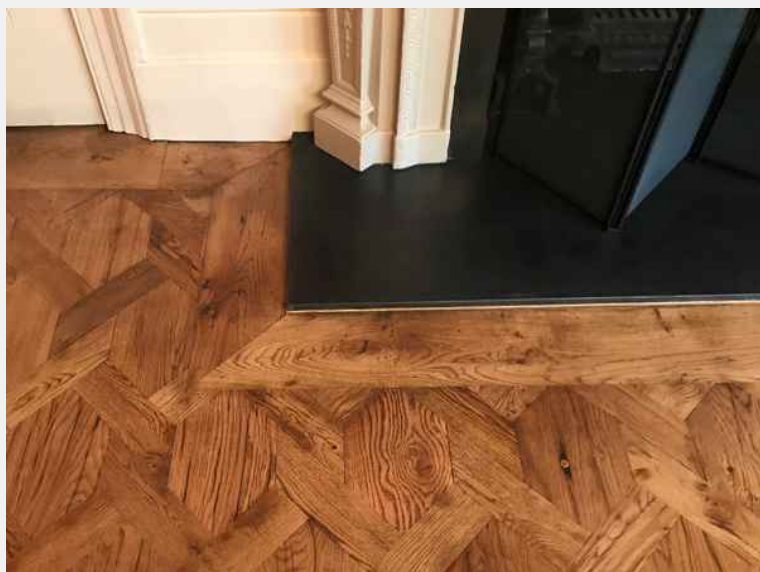
Installed by British Wood Flooring Company